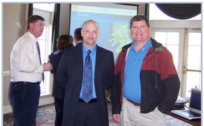
Members from the Sunrise Rotary Club enjoy the GSE presentation