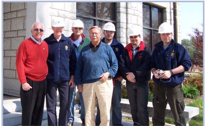
The GSE Team from Scotland take a tour the Mount Airy Granite Quarry