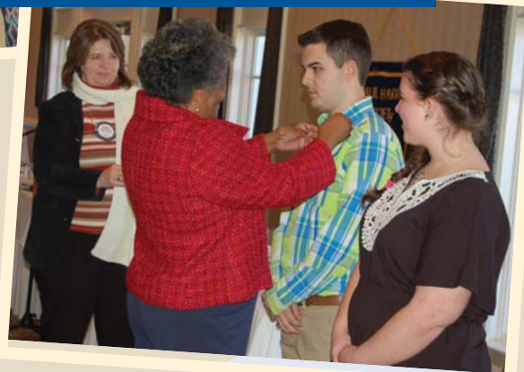
Surry Central Interact Club