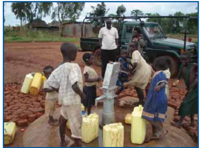
Fresh water flows