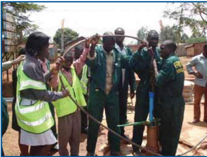
Working on the well