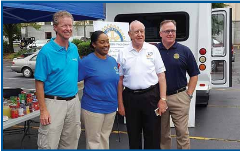
Rotarian leaders gather during the RUSH food drive

Rotary was filling the cart on August 8 at the Hampton Inn in Mount Airy. The Rotarians in our area united to stop hunger until 2 p.m. along with the International Rotarian President. All together we collected $15,000 in canned goods and donations.