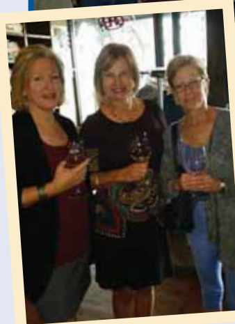
Fellowship fun at Old North State Winery