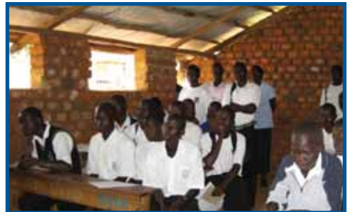
Students at Koch Goma School