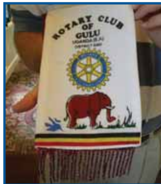
Rotary Club of Gulu Uganda