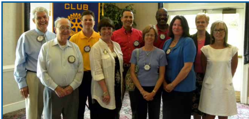
Your Board of Directors