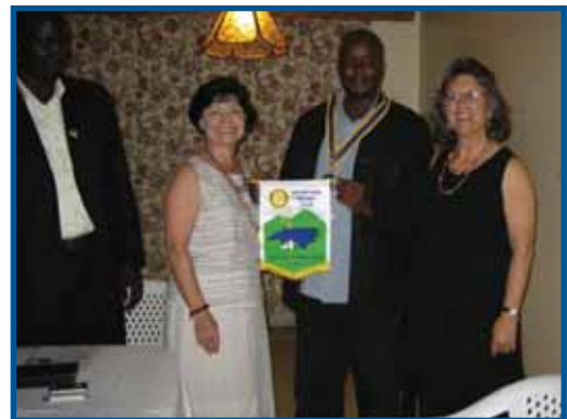
Presentation of Rotary Flag