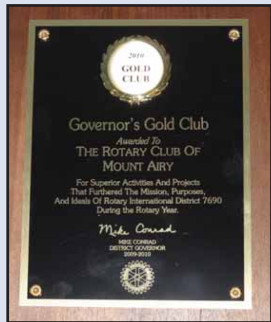
Gold Club Award 2009-2010

Next year the conference will be in Wilmington, NC at the newly renovated Hilton Hotel right on the Cape Fear River on the famous boardwalk in downtown Wilmington.