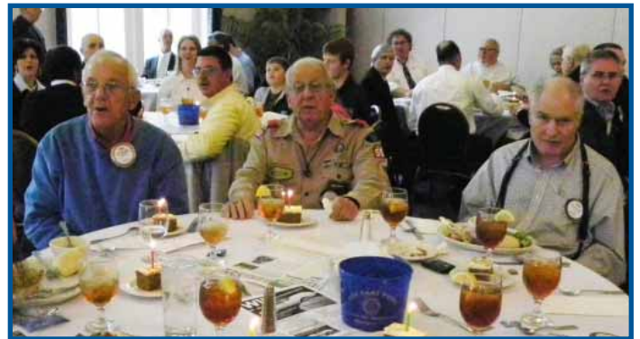
Rotary celebrates 100 years of Boy Scouting

The Boy Scouts of America was incorporated on February 8, 1910 under the laws of the District of Columbia. 34 national representatives of boys' work agencies met in temporary quarters at a YMCA office in New York to develop the plans. Honorary President was President William Howard Taft and Honorary Vice President and Chief Scout Citizen was former President Theodore Roosevelt.