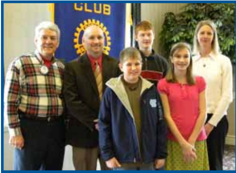
Pilot Mountain Middle School Folks

If you don't think pennies add up, just ask any 8th grader from Pilot Mountain Middle School. The students wanted to do something to help Haiti and boy did they go at it. They set a goal of $1,000 and raised $2,000 and donated it to the Mount Airy Rotary Club to purchase 2 Shelter Boxes which will be distributed in Haiti. Rotary has been involved with Shelter Box USA for several years as a way to assist victims of disasters by providing shelter and essential supplies until more permanent help can be found.