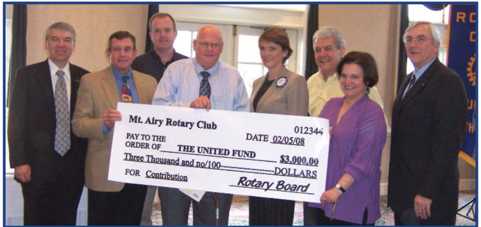
United Fund receives check