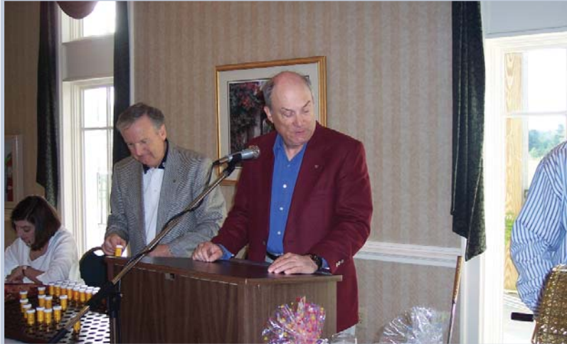
Almost ready to begin