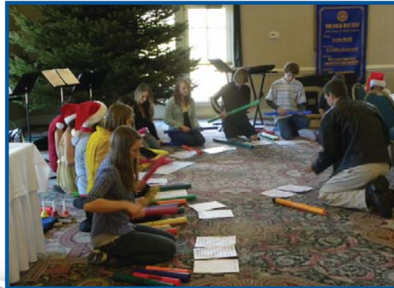
Making Music— Millennium Charter Academy

Christmas is the time we get to hear from several school groups in our community. It is always a pleasure to enjoy the voices and talents of our local youth and it gives them an opportunity to perform before a large group.