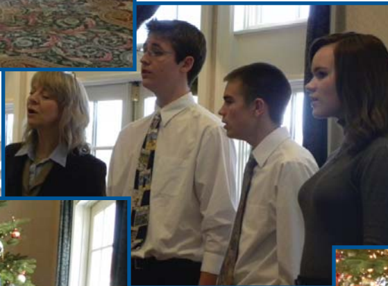
North Surry High School Ensemble