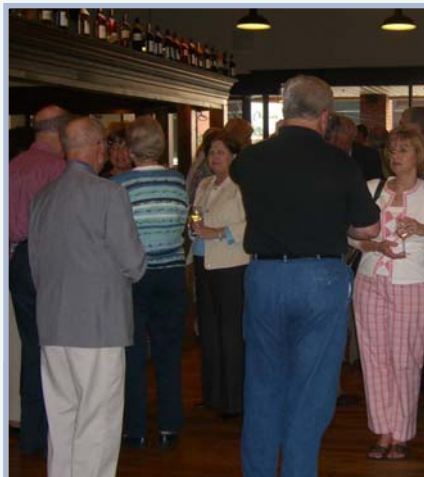
Enjoying the Dinner and Entertainment