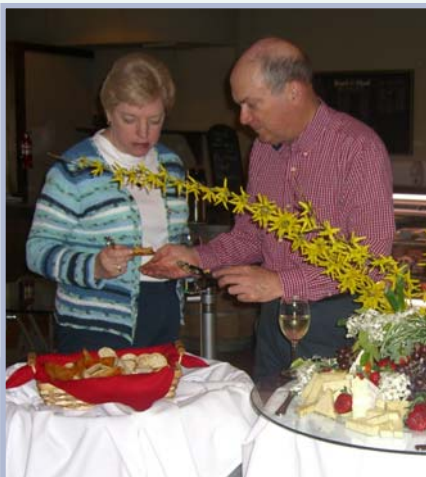
Him and Her