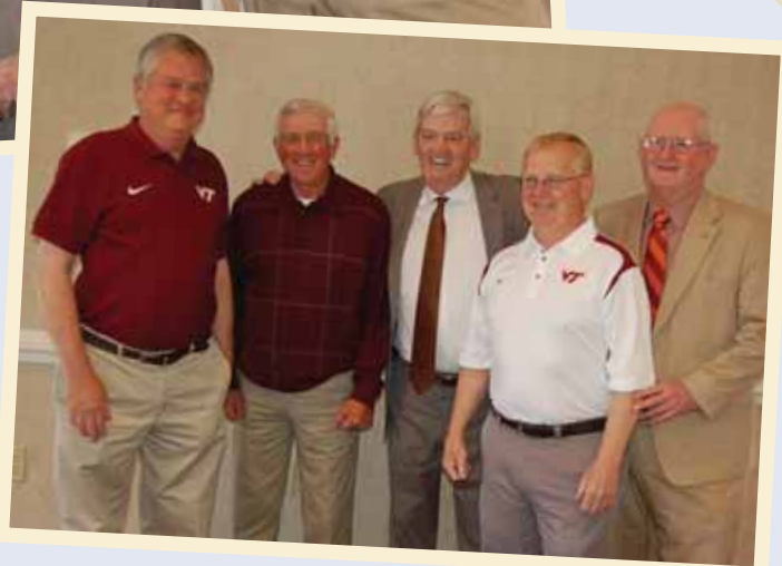
Pictured above, Frank Beamer with his high school friends and team mates when he attended Carrol County High School.