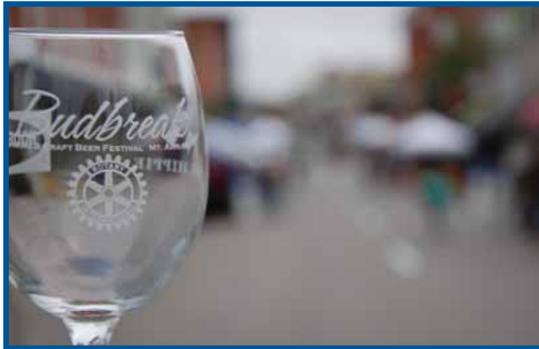
Budbreak success even with cloudy skies

Rotarians did a great job organizing, planning, volunteering and promoting the Budbreak again this year. The crowd enjoyed the vendors and the entertainment of Time Sawyer. The rain held off which allowed visitors to enjoy the flavors and the fellowship with one another. Additional photos on page 2.