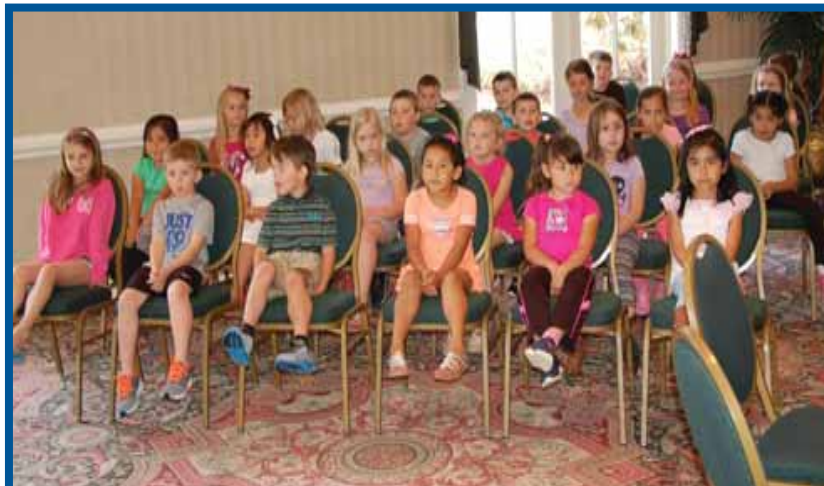
A kindergarten class which is part of the Spanish Immersion Program showed off their spanish skills with songs and reading from The Hungry Catepillar.