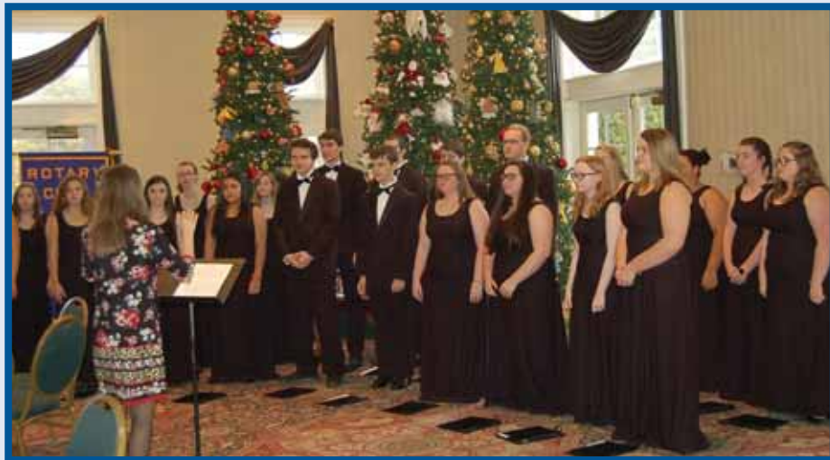
East Surry Chorus was the first group to share the Christmas Spirit with the Noon Club.