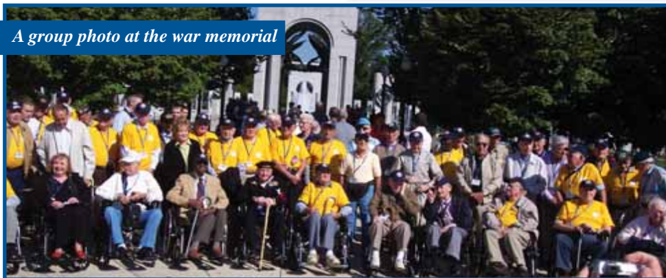
A group photo at the war memorial