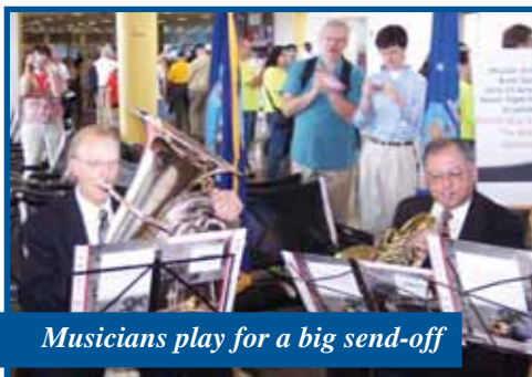
Musicians play for a big send-off