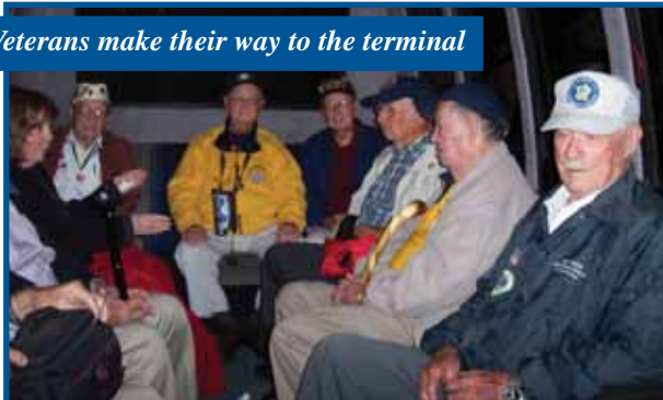
Veterans make their way to the terminal

At Reagan International airport we were greeted by the DC Symphony Brass and dozens of well wishers, and then loaded onto buses for the day long visit to the WW II, Vietnam, Korean, and Air Force Memorials as well as sight seeing of all the history of Washington DC. At the end of the tour we were again escorted by motorcycles back to Reagan for the flight home.