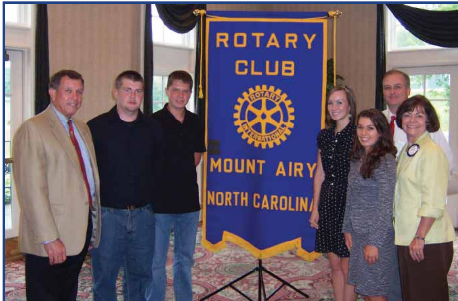
Youth Leadership Scholars visit Rotary.