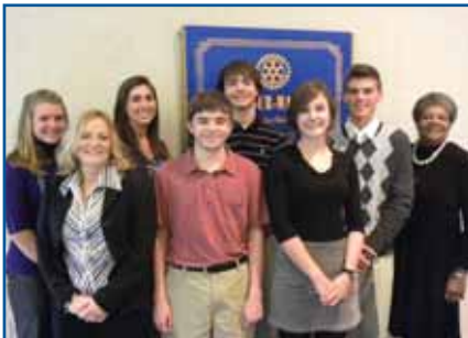
Interact Officers and Advisors