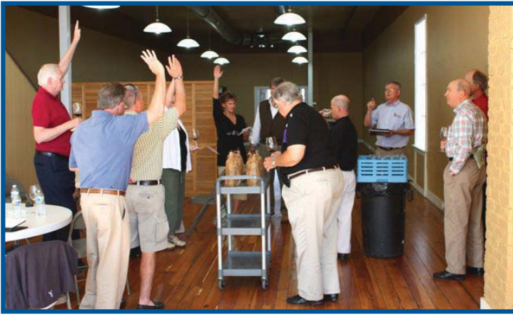
A final vote between two favorite wines during the wine tasting.

the Mount Airy News for making this year a success. For other sponsors not connected to Rotary members, please review the festival website. We look forward to making this event become not only a major fund raiser for our charities, but an economic benefit for our community.