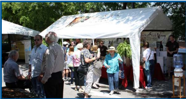
Below: A judge for the Wine Tasting compares two favorites.