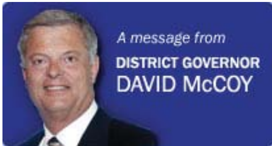
A message from DISTRICT GOVERNOR DAVID MCCOY