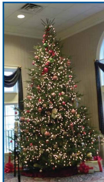
Lovely Christmas tree