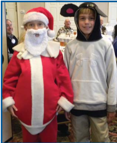
Santa and a Reindeer