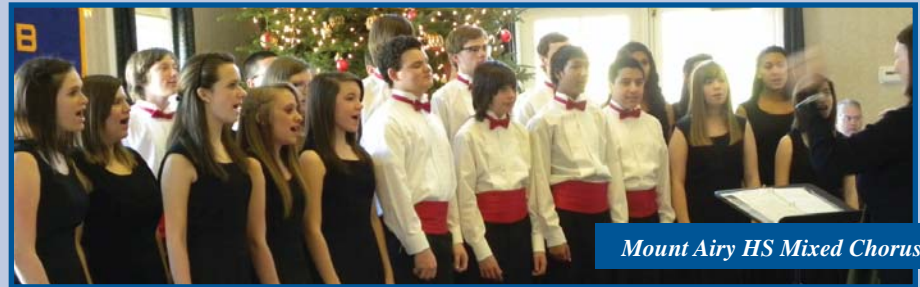
Mount Airy HS Mixed Chorus