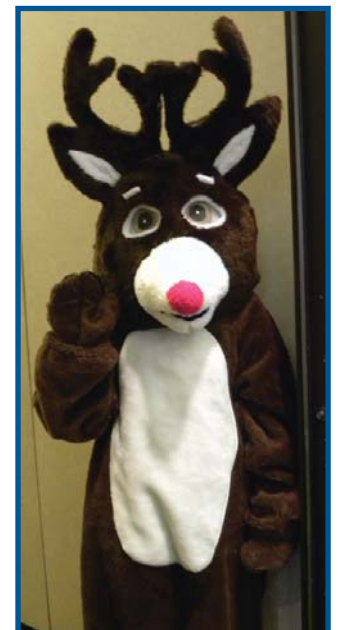
Rudolph the Reindeer