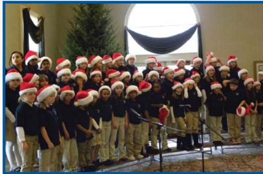
Jones School Music Group