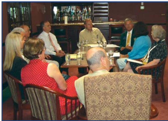
Governor visits with board.