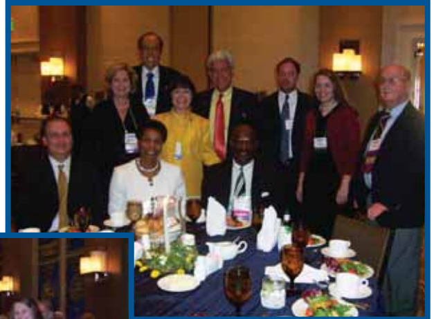
Mount Airy Rotary attendees.