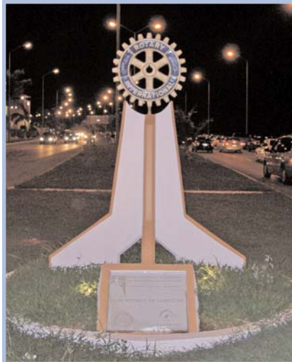
This picture was taken by one of SouthData's employees who recently spent time in Mexico. This was on the seafront highway in Campeche, Mexico.

Club Make Ups - Please remember to sign any club make-up slip you receive when visiting another club. It won't do any good turning them into our club secretary if she doesn't know who it belongs too.