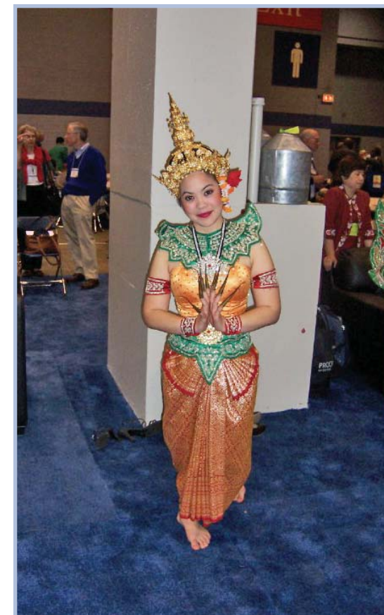
One of the dancers from Thailand.