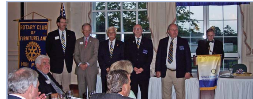
AG's being installed